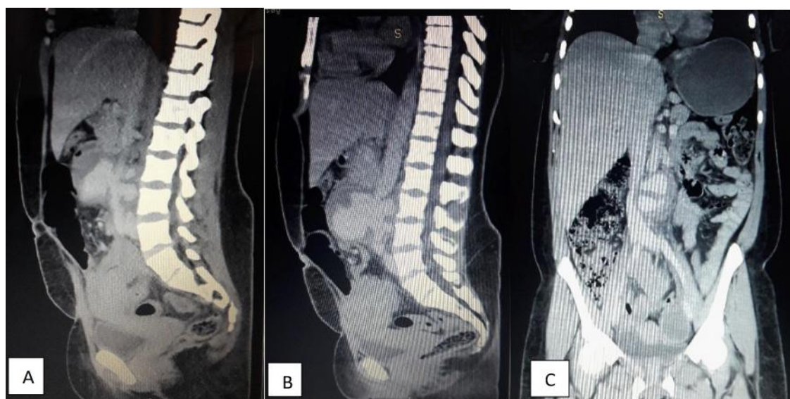
Figure 2: (A&B) Sagittal views of contrast enhanced CT of the abdomen (arterial phase) of a 37-year-old female showing multiple anterior and posterior saccular aneurysms. The eccentric filling defect on the anterior aneurysm is a thrombus. (C) Coronal view shows the compression of the inferior vena cava by an aneurysm

Imaging plays a vital role in the diagnosis and follow up of patients with aortic aneurysms. It can also give a clue to the risk or causative factors. US is usually the cost-effective initial imaging modality used in diagnosis of aneurysms as seen in this patient, it is safe and widely available 9 . Cross sectional images like CT and MRI are integral component in the diagnosis, follow up and management of AAA 1 . In this patient, US was able to demonstrate the aneurysms, the intraluminal thrombus and turbulent flow on Doppler interrogation. The abdominopelvic CT done, better demonstrated the aneurysms as regards their exact locations, proximity to each other and size measurements. It also helped to rule out atherosclerosis in this patient, however, the